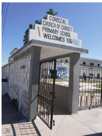
Figure 1. Picture of Corozal Church of Christ entrance.

Prior to this project, the Corozal Church of Christ school had only one urinal and two toilets for its 125 boys and only two toilets for its 119 girls. Now the school has three toilets in each of the male and female bathrooms with at least one wheelchair accessible cubicle in each.