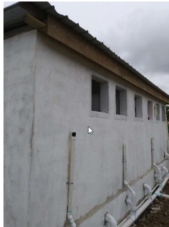
Figure 8. New exterior and fascia.