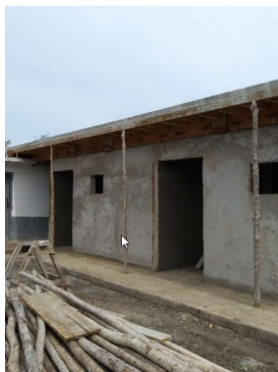
Figure 1. New construction.