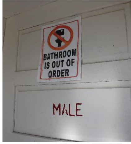
Figure 5. Before work began.