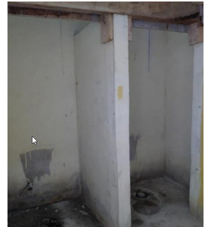
Figure 9. Old fixtures removed.