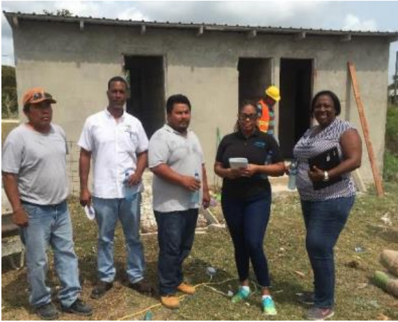
Figure 4. Team inspecting construction site.