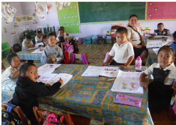
Figure 3. Children at Chunox SDA Primary School.