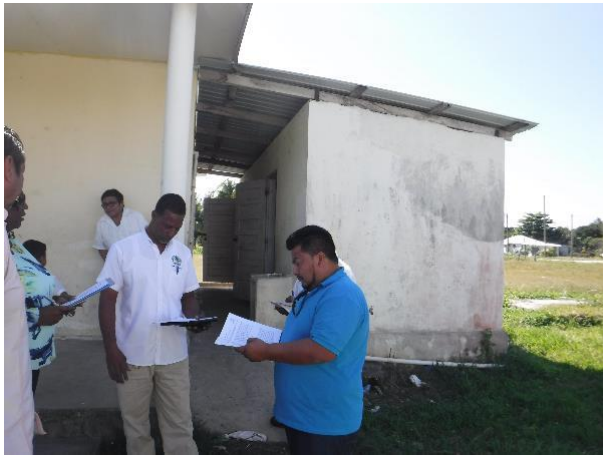
Figure 7. Team inspection of construction site.

Prior to this project, both schools lacked bathrooms suitable for students with special needs, even though there was a special education center on site serving four students. Each school had only one toilet serving the 205 students at Chunox Roman Catholic and the 107 students at Chunox SDA, as well as two additional toilets for the approximately 20 preschoolers on site. By June 30th, the male and female bathrooms will each have two toilets, a shower, and a hand washing basin and the entire WASH infrastructure (all the plumbing and electrical fixtures) for both bathrooms will be replaced with new American Standard fixtures. An accessibility ramp will also be installed so that the bathrooms are wheelchair accessible.