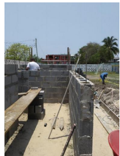
Figure 3. Renovation.